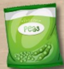
FROZEN FOOD BAGS