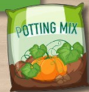
MULCH OR SOIL BAGS